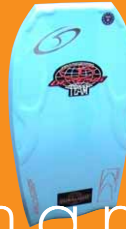
High spec body board utilises the high stiffness to weight ratio of Plastazote

Azote foams are probably the most widely used closed cell foams in the sports and leisure industry. Their superior properties and performance characteristics make Azote foams the natural choice for many different and varied applications, from swimming aids to sports orthotics; back packs to body protectors; cricket pads to camping mats and helmet liners to handlebar pads.