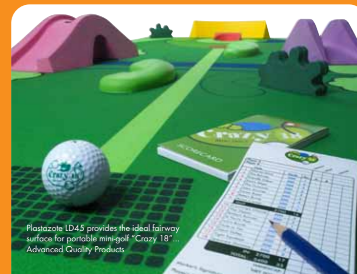
Plastazote LD45 provides the ideal fairway surface for portable mini-golf "Crazy 18"... Advanced Quality Products