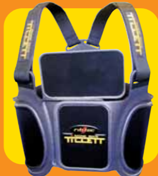
Ribtec kart racing chest protection... Tillet Racing