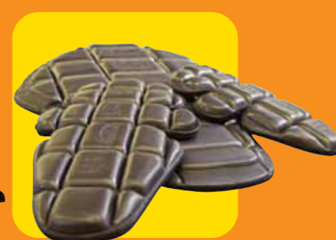
CE approved, super impact absorbent motorcycling body armour... Planet Knox