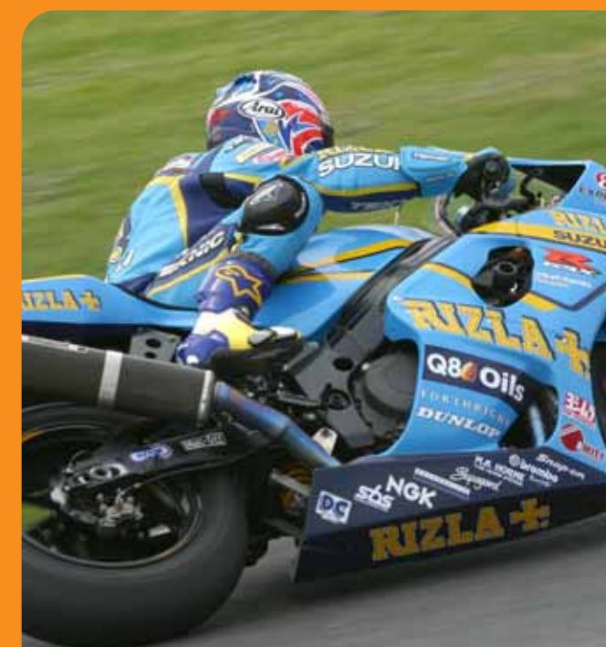
John Reynolds 2 x British Superbike Champion is protected by Knox body armour incorporating Plastazote