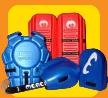
International field hockey keepers protected by Plastazote's impact absorbing properties