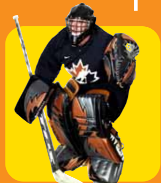
Plastazote provides durable, lightweight protection in ice hockey goalie pads and upper body protectors... Battram Custom Goal Equipment

These outstanding properties stem from Zotefoams' unique manufacturing process technology, which produces pure, chemically inert foam without blowing agent residues and with a uniform cell structure with regular cell walls.