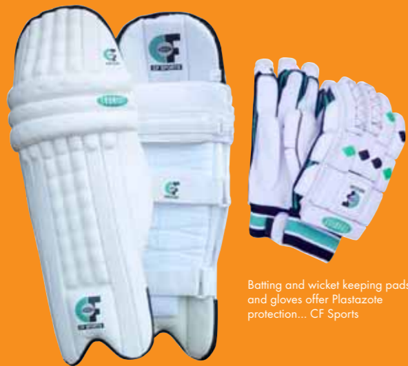
Batting and wicket keeping pads and gloves offer Plastazote protection... CF Sports